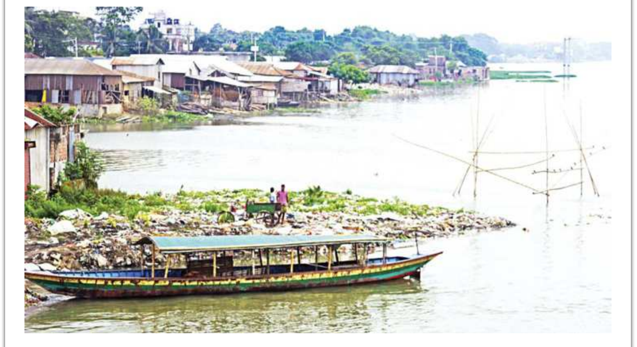
At Bangshi river, illegal establishments, indiscriminate waste dumping, and sand trading is an ever-present sight.

However, the UNO, who is the government's administrative chief SEE PAGE 4 COL 5