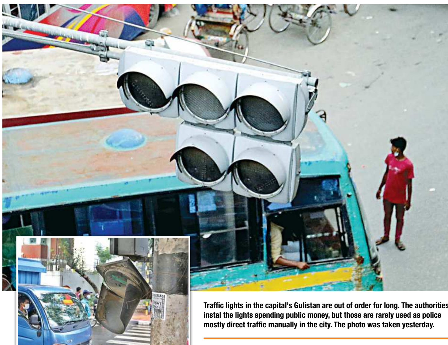
Traffic lights in the capital's Gulistan are out of order for long. The authorities instal the lights spending public money, but those are rarely used as police mostly direct traffic manually in the city. The photo was taken yesterday.