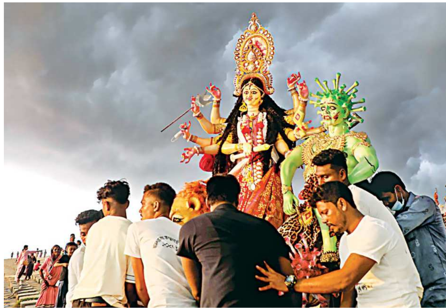
Hindu devotees carry an idol of Goddess Durga to the beach in Chattogram city's Gongosan area to immerse it into the Bay yesterday, the last day of the five-day Durga Puja. Devotees bade farewell to the deity and her children through the immersion of their idols, wishing her return next year.