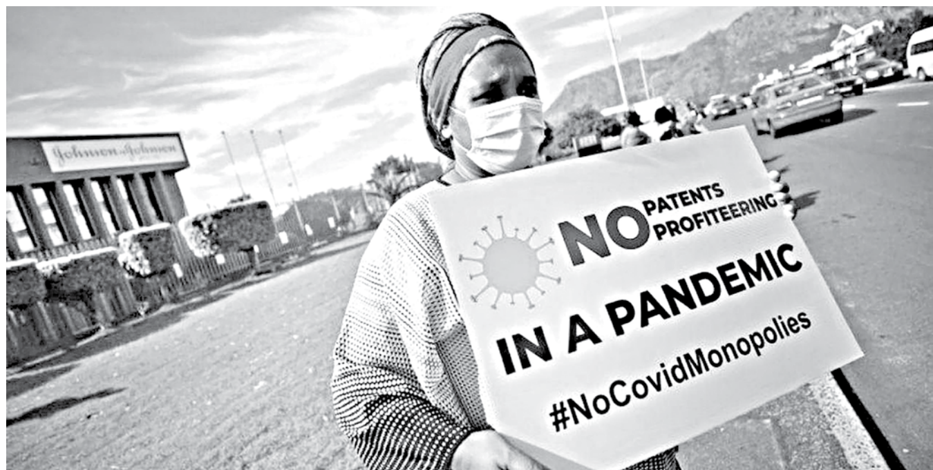
Vaccine-producing nations need to suspend or modify intellectual property protections for Covid-19 jabs to accelerate vaccine production, inoculate more people quickly, and stay ahead of further virus mutations.

Half a year ago, President Biden had announced that the US would support a vaccine patent waiver. His vaccine summit before the UN General Assembly was promising, but again did not deliver much. He can still make a world of difference, uniting the world to defeat the pandemic. Without White House