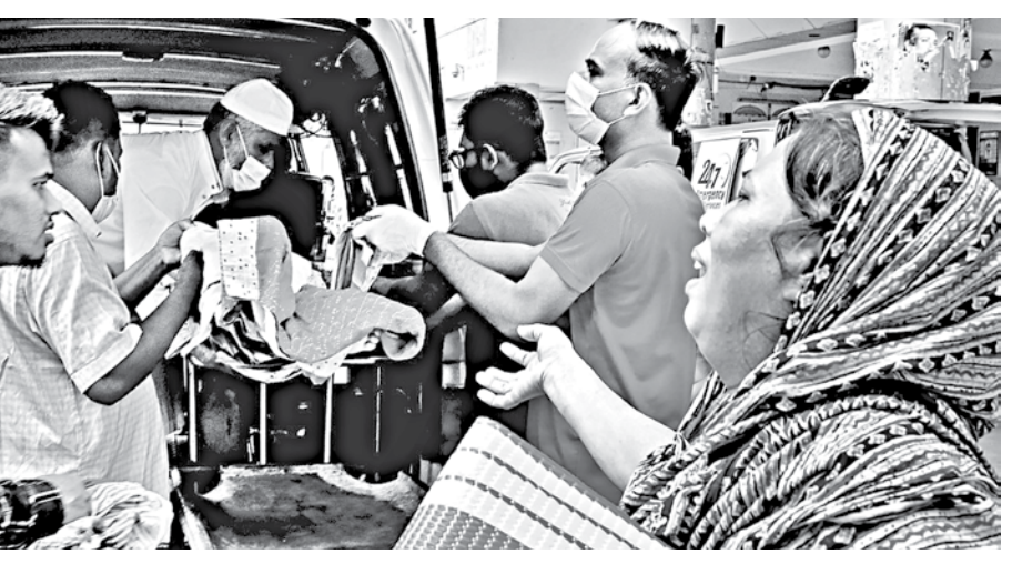
We must not let our guard down, even when the situation seems most bleak, so that we can stop scenes like this from occurring altogether.

Our indifference is going to have a lasting impact in a post-Covid-19 scenario. It can damage the way we process not only human emotions, but human values. According to a BBC report, there is already evidence that people are suffering from Covid-19 news fatigue and reading less and less about the pandemic. The lack of care also shows through the reluctance to wear masks, sanitise hands, or maintain social distance. One explanation could be because humans are selfish creatures. We want to help others to feel good, but with the rise in numbers, when the situation seems