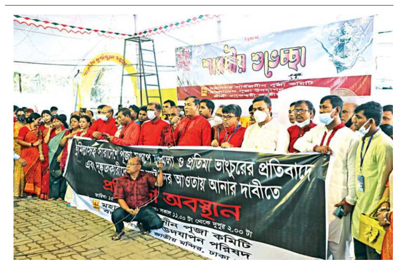
Mahanagar Sarbojonin Puja Committee protested the vandalism of mandaps and idols across the country amid the Durga Puja celebrations at Dhakeshwari temple in the capital yesterday.