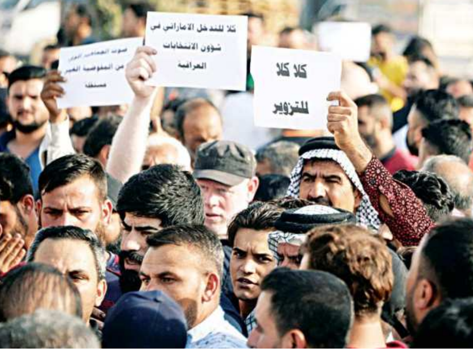
Iraqis protest against the results of parliamentary elections in the northern city of Mosul yesterday. The sign in Arabic in the middle reads "No, no to fraud". War-scarred Iraq -- an oil-rich country plagued by corruption and poverty -- on October 10 held its fifth parliamentary elections since the 2003 US-led invasion toppled dictator Saddam Hussein.

Deadline for registration: 31 October 2021 at 16:00 hrs Dhaka time