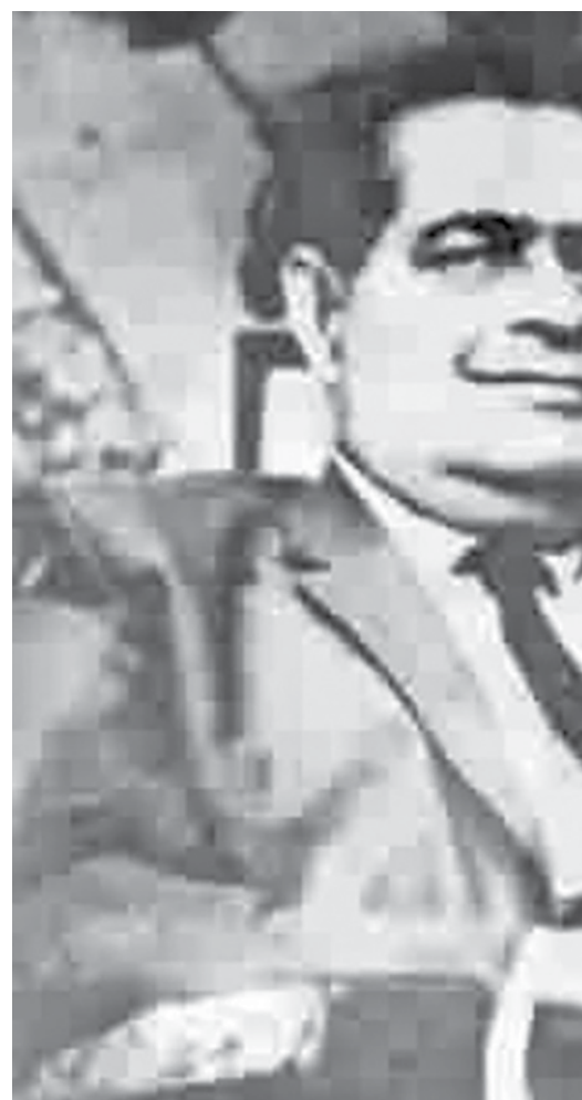
Tofazzal Hossain Manik Miah (1911-1969)