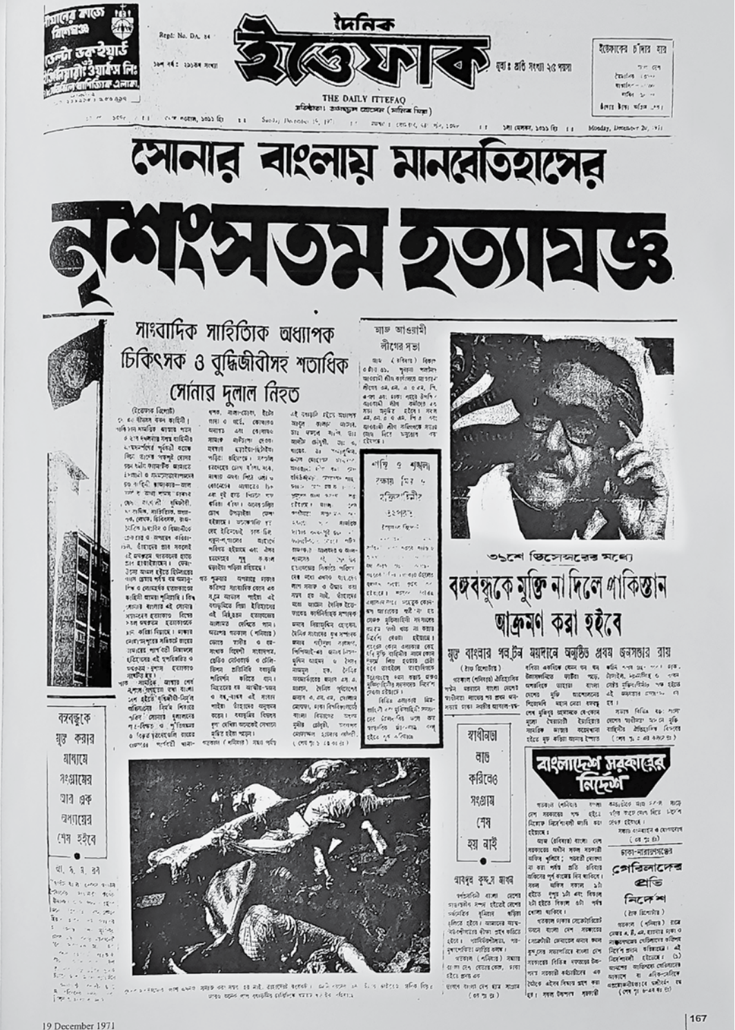
The front pages of the Daily Ittefaq covering the last days of the 1971 Liberation War, from the publication "Front Pages 1953-1972"