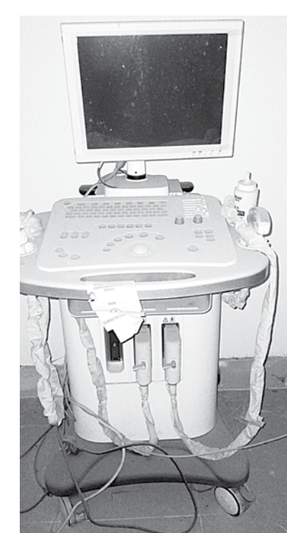
Without providing any radiologist to operate it, this expensive ultrasound machine -- installed at Faridpur's Modhukhali Upazila Health Complex -- is only collecting dust for years and awaiting its disintegration from decay.

Abdus Salam, health and family planning officer in Modhukhali upazila, said, "We've got an expensive ultrasound machine. It was installed on December 19, 2016. But it has been sitting idle for long due to a lack of trained operators and doctors."