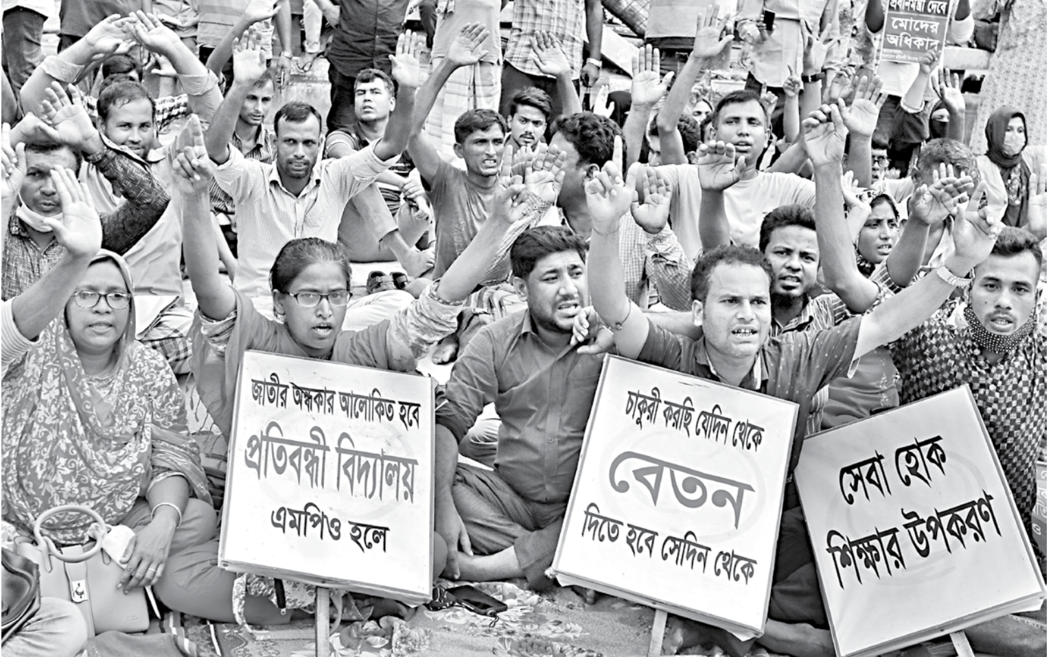
The teachers of schools for children with special needs have been staging a protest to press home their 11-point demand, including adding them to the list of MPO enlisted schools, in the capital's Shahbagh area. Even a drizzle couldn't surmount their spirits on the fourth day of the protest yesterday, as they urged for the prime minister's intervention.