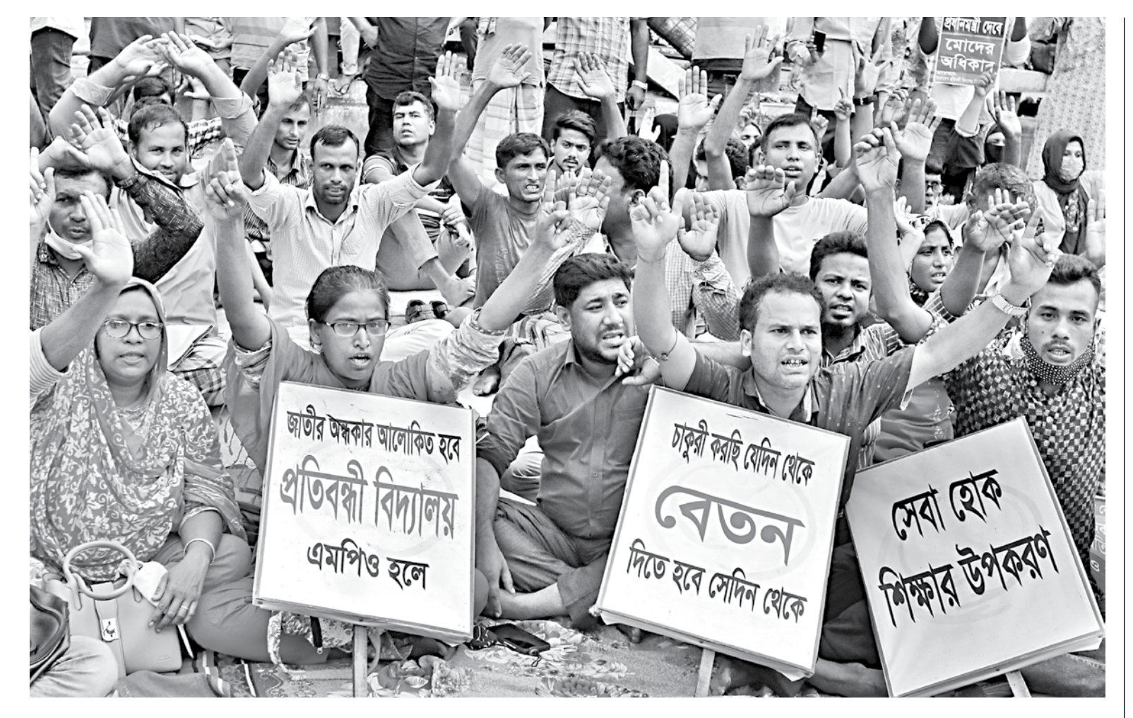
The teachers of schools for children with special needs have been staging a protest to press home 11-point demand, including adding them to the list of MPO enlisted schools, in the capital's Shahbagh area. Even a drizzle couldn't surmount their spirits on the fourth day of the protest yesterday, as they urged for the prime minister's intervention.