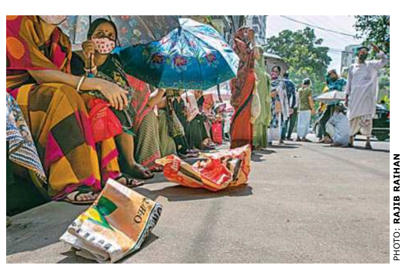
The queues in front of TCB trucks are getting longer by the day, amid soaring prices of daily essentials. Port city residents occupy many of the roads from the morning and wait for hours in the swelter just to get their groceries for cheap. The photos were taken yesterday.