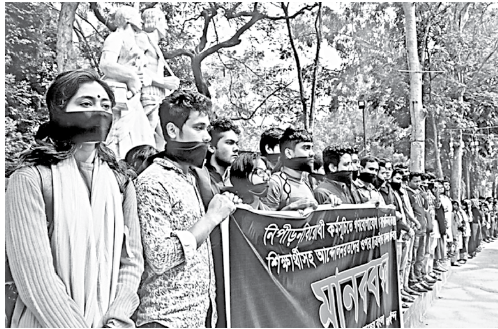
Students and teachers should not have to be afraid of expressing their opinions.