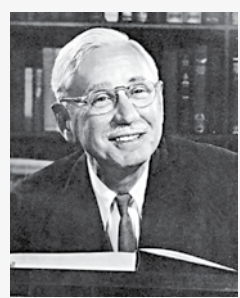
WILL DURANT (1885 - 1981) American writer

To say nothing, especially when speaking, is half the art of diplomacy.