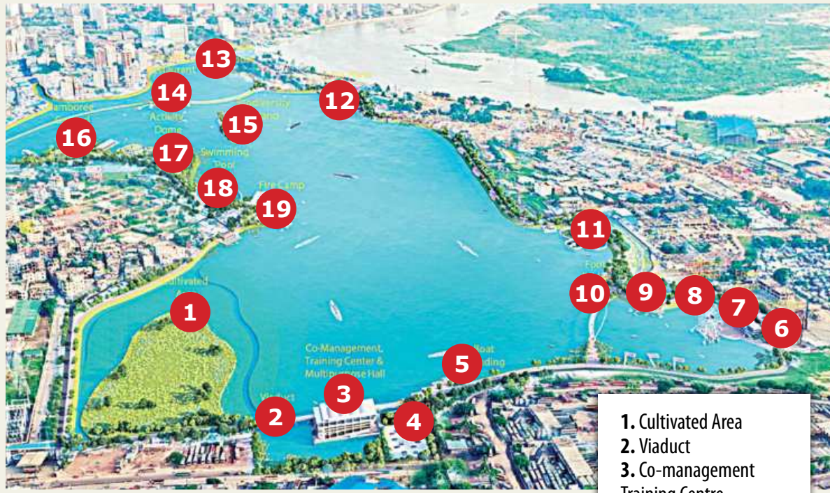
The eco-park will feature attractions such as a lotus pond and ferris wheel.