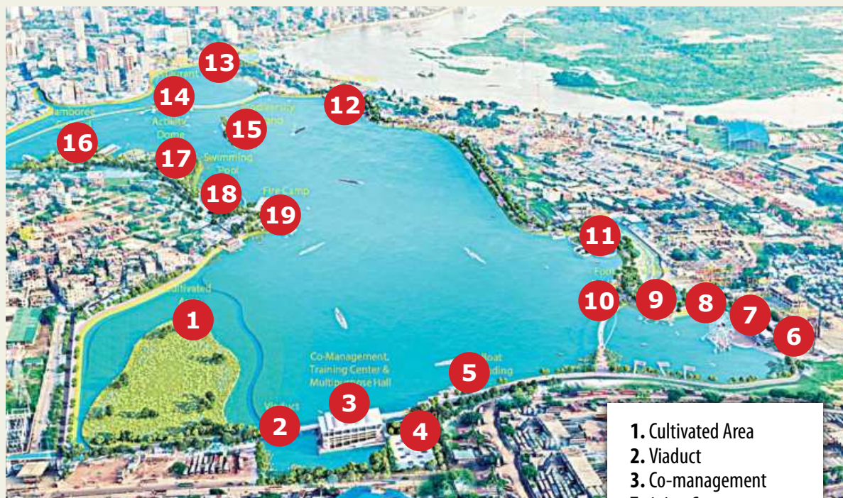
The eco-park will feature attractions such as a lotus pond and ferris wheel.