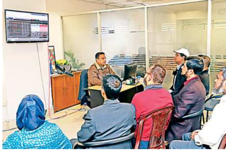
Investors watch fluctuations of stock prices on a screen at a brokerage house in Dhaka.