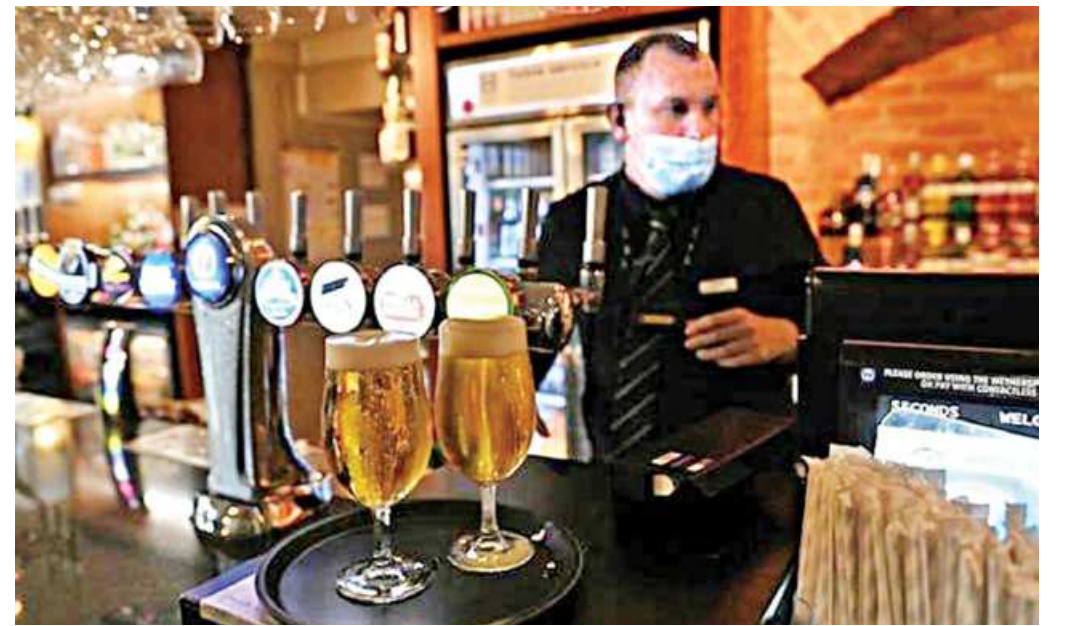
The lifting of coronavirus curbs to allow more socialising provided Britain's economy with a boost but the recovery still faces headwinds, such as supply chain woes and inflation.

"Paul Dales, chief UK economist at research consultancy Capital Economics, warned the economy might flatline as a result of supply bottlenecks."