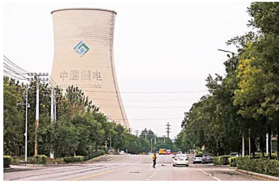
A person walks near a coal-fired power plant in Shenyang, China on September 29.