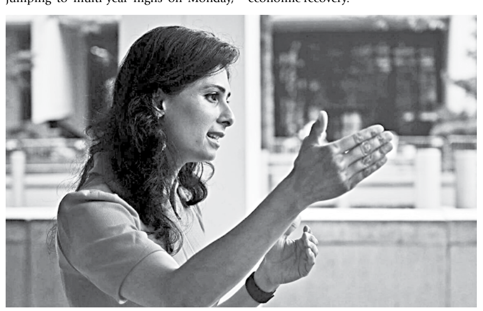
IMF Chief Economist Gita Gopinath said she does not expect high oil prices to lead to a 1970s-style economic crisis.

The increase in energy prices has ramped up fears that overall inflation could tick even higher and hinder the global economic recovery.