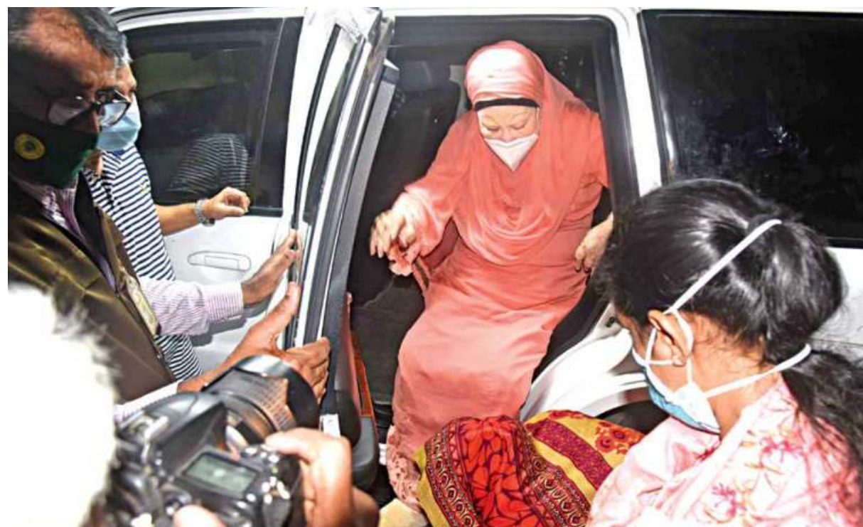
BNP Chairperson Khaleda Zia gets off a vehicle at Evercare Hospital in the capital yesterday. The ailing former prime minister was admitted to the medical facility for treatment and medical tests.