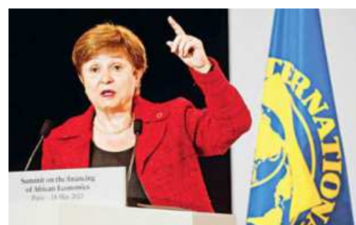
KRISTALINA GEORGIEVA IMF MANAGING DIRECTOR

A native of Sofia, she taught economics there for 26 years, and built up environmental experience with a focus on agriculture and sustainable development.