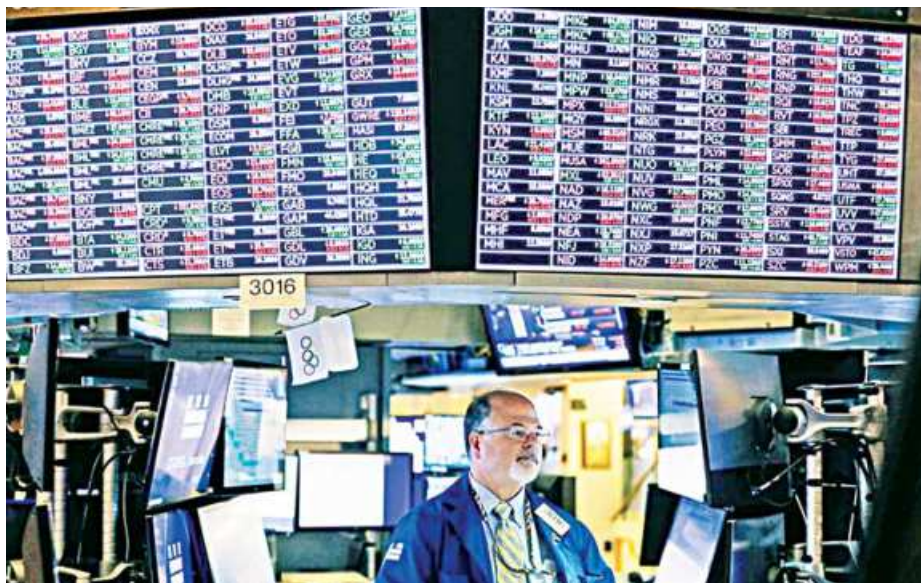
A trader works on the floor at the New York Stock Exchange in Manhattan, New York City, US on September 24.

Analysts see a 29.6 per cent year-over-year increase in earnings for S&P 500 companies in the third quarter, according to IBES data from Refinitiv as of Friday, down from 96.3 per cent growth in the second quarter. The third-quarter forecast is down a touch from several weeks ago, a reversal of the recent trend for estimates.