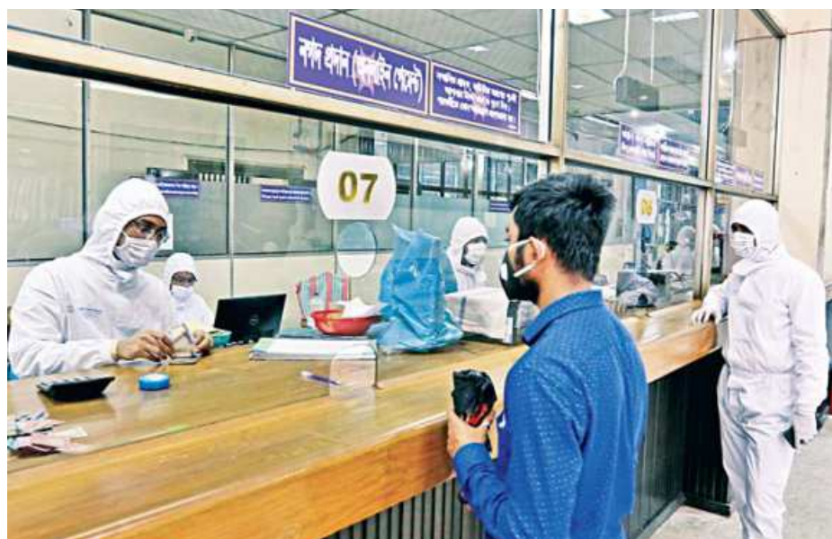
Bankers wearing personal protective equipment (PPE) offer services at a bank in Dhaka. The global PPE market is projected to surpass $93 billion by the end of 2025, according to a study.

The EU currently leads the charts for medical textile imports while the demand