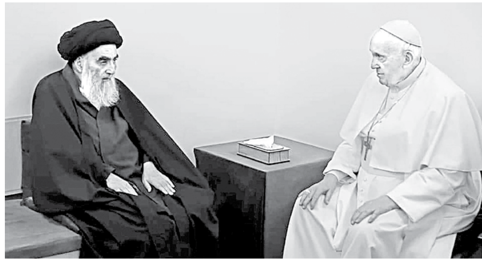
Pope Francis meets with Iraq's top Shia cleric, Grand Ayatollah Ali al-Sistani, in Najaf, Iraq, on March 6, 2021.

The Middle East's rivalries and shifting sands lend added significance to a planned visit in the coming weeks to Najaf, an Iraqi citadel of Shia Muslim learning and home to