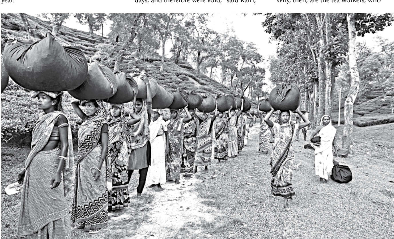
The wage structure announced by the Minimum Wage Board deprives the tea workers of Bangladesh of what they deserve.

Despite all the strong arguments shared by different quarters, including the tea workers' union, the owners' side remains rigid about their position to not increase wages at all. With the workers' representative technically excluded, the wage board has blindly taken the owners' side. We can safely say that the owners have hijacked the wage board, to safeguard their profits. This is not fair. The immediate role of the government is to see that justice is done in giving fair wages to the tea workers.