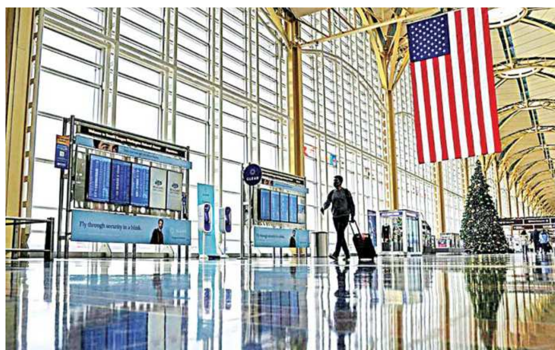
A traveller walks past a Christmas tree as he makes his way through the Ronald Reagan Washington National Airport in Arlington, Virginia.

The airline industry last week committed to reach "net zero" emissions by 2050 at a meeting in Boston, decades beyond the