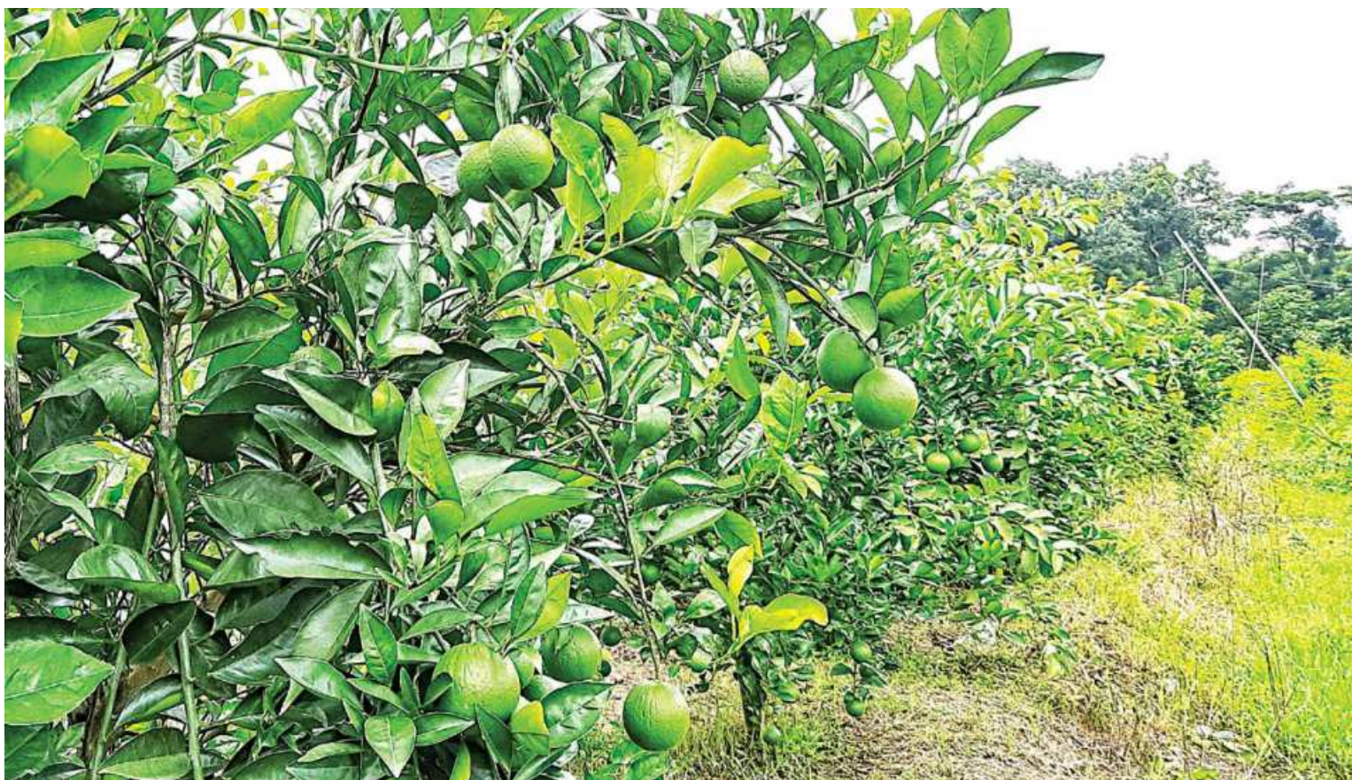
Locally grown malta is being sold for between Tk 90 and Tk 120 per kilogramme depending on the size and variety while the imported ones cost Tk 220 per kg.