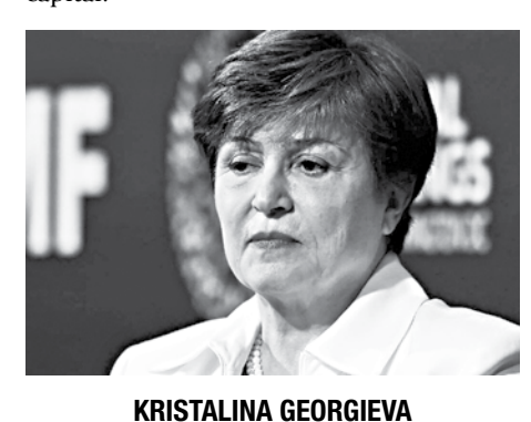
IMF MANAGING DIRECTOR

The push came while bank leadership was engaged in sensitive negotiations with Beijing over increasing the bank's lending