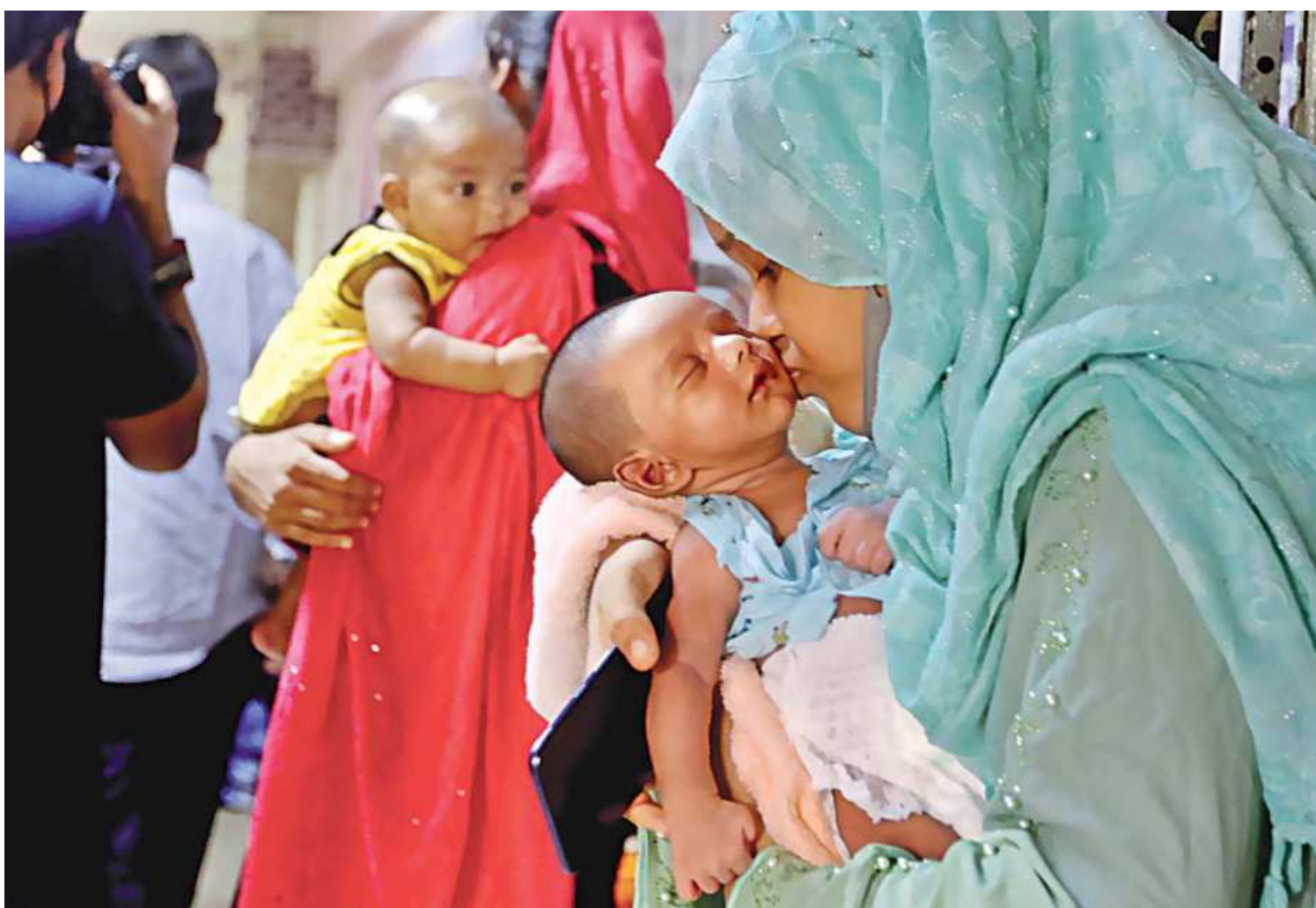
Recent dips in nighttime temperature are causing many children to catch cold-related diseases. The photo of the mothers with their newborns suffering from cold was taken at Dhaka Shishu Hospital yesterday.