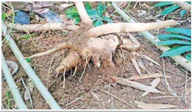
Cassava shrubs are being grown amidst other plants and trees on fallow land in Sylhet division, bringing utility through the harvest of its roots, the starch from which is used in making food, garments and medicine. Pran-RFL Group buys the roots offering contractual farming, lowering the risk of losses for producers. The photo was taken in Kulaura upazila of Moulvibazar recently.