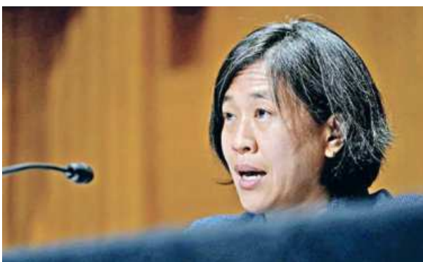
US Trade Representative Katherine Tai testifies before the Senate Finance Committee on Capitol Hill in Washington, US on May 12.