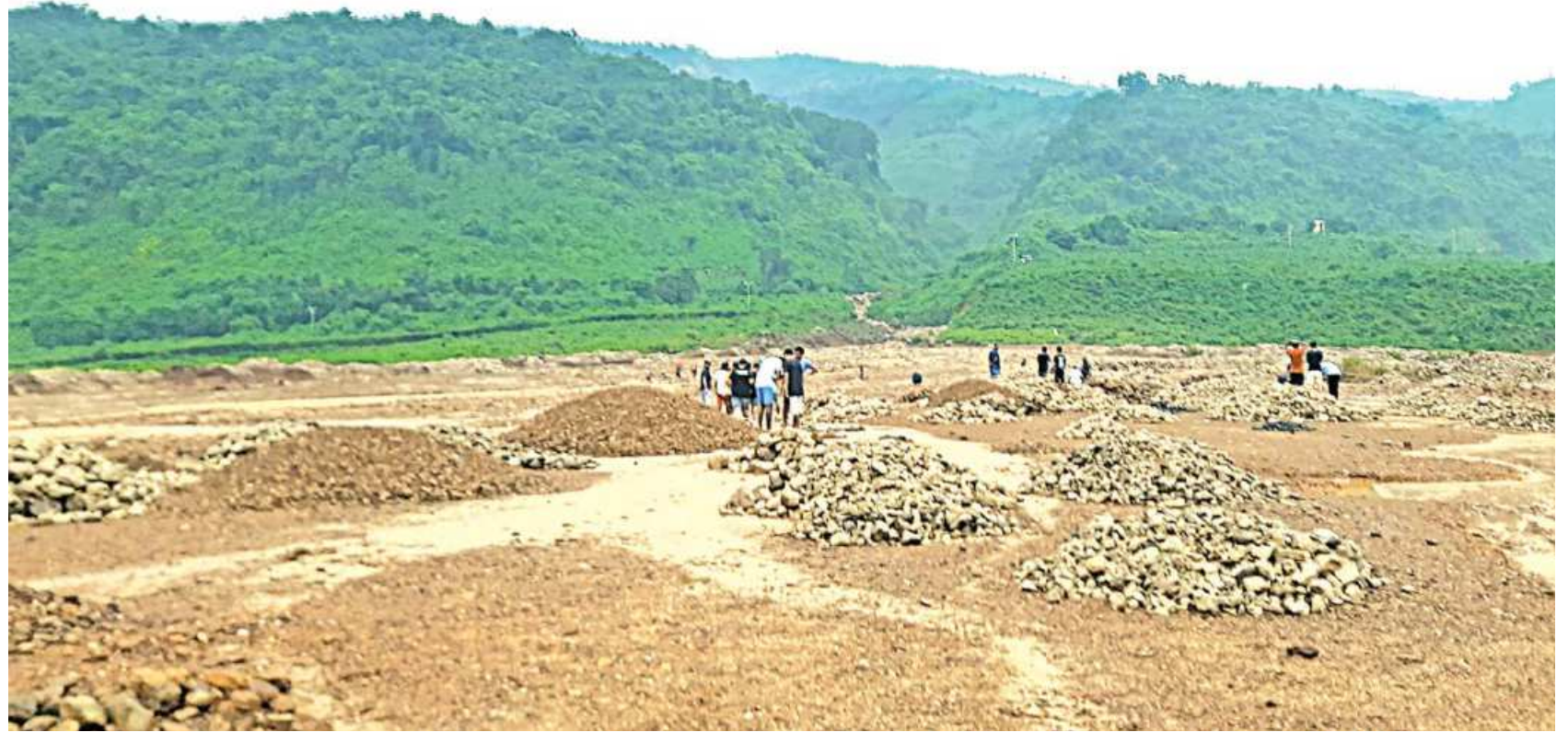
Locals in Sunamganj's Tahirpur upazila collecting pebbles and stones from a farmland that is now covered with sand. During flash floods, sand, stone and coal from the Khasi Hills of India's Meghalaya wash into the area, resulting in degradation of farmlands, roads and houses. The photo was taken recently.