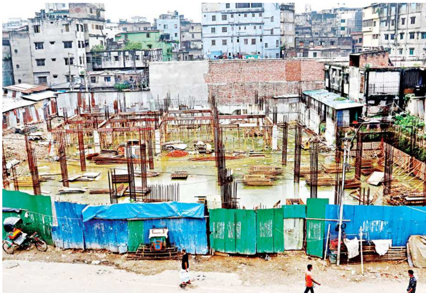
A view of a construction site located in the capital's Kaptan Bazar. As seen in the photo, virtually all of the area dug up for construction has become waterlogged following recent rainfall. Clean standing water such as this is a breeding ground for Aedes mosquitoes, carriers of the dengue virus. The photo was taken yesterday.