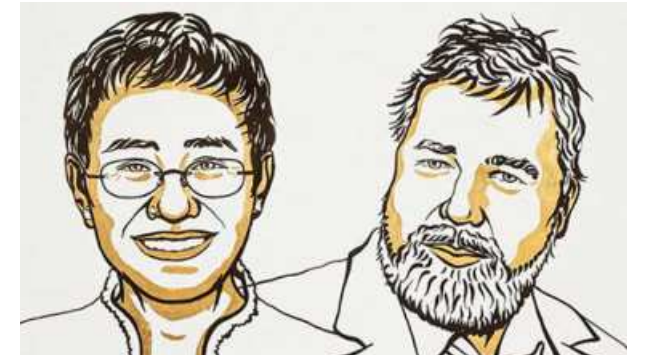
Maria Ressa and Dmitry Muratov