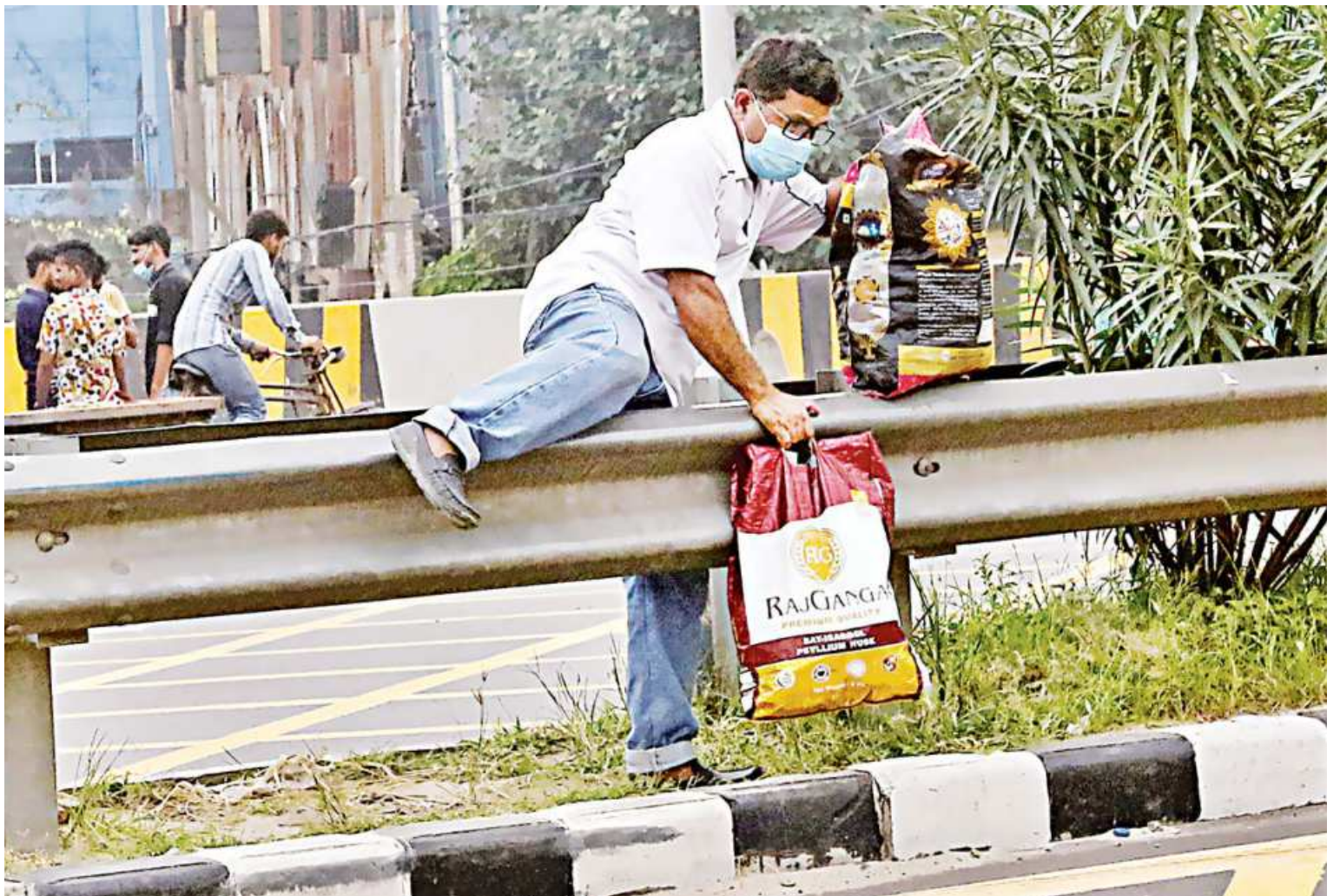
Carrying bags in his hands, a jaywalker crosses the central reservation on Dhaka-Mawa Expressway in the capital's Postagola. Jaywalking often jeopardises people's lives and disrupts the flow of traffic. The photo was taken yesterday.