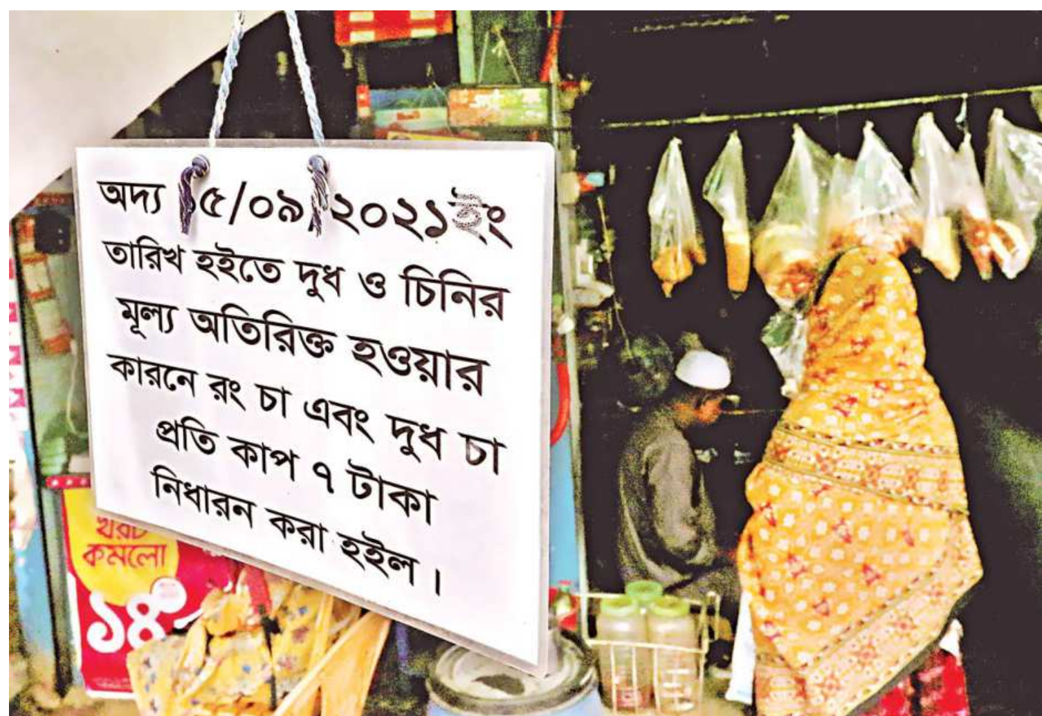
A tea stall in the capital's Shyampur has put up a notice saying the price of a cup of tea has been fixed at Tk 7, an increase of Tk 2, as the prices of sugar and milk have gone up. Sugar now sells at Tk 90 a kg, up from Tk 75 about a month ago. The price of condensed milk has also soared to Tk 75 per 400gm can, an increase of Tk20 from a month ago. The photo was taken yesterday.