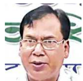
Abul Kalam Azad