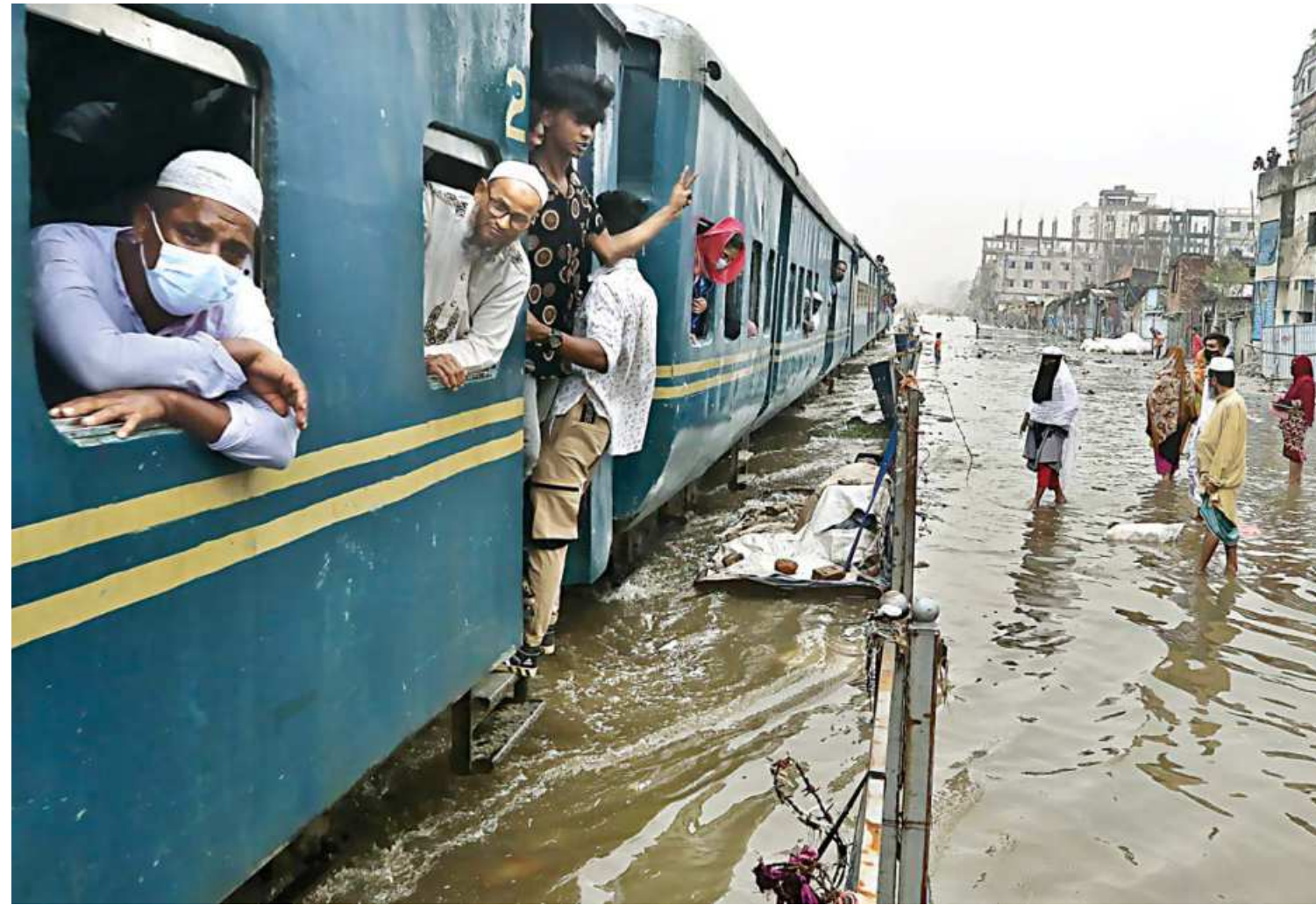
A train travels on rails that have gone under water after a not so heavy rain near Jurain Rail Gate area in the capital yesterday. Due to poor storm-water drainage, nearly a kilometre of the rail lines were under water.