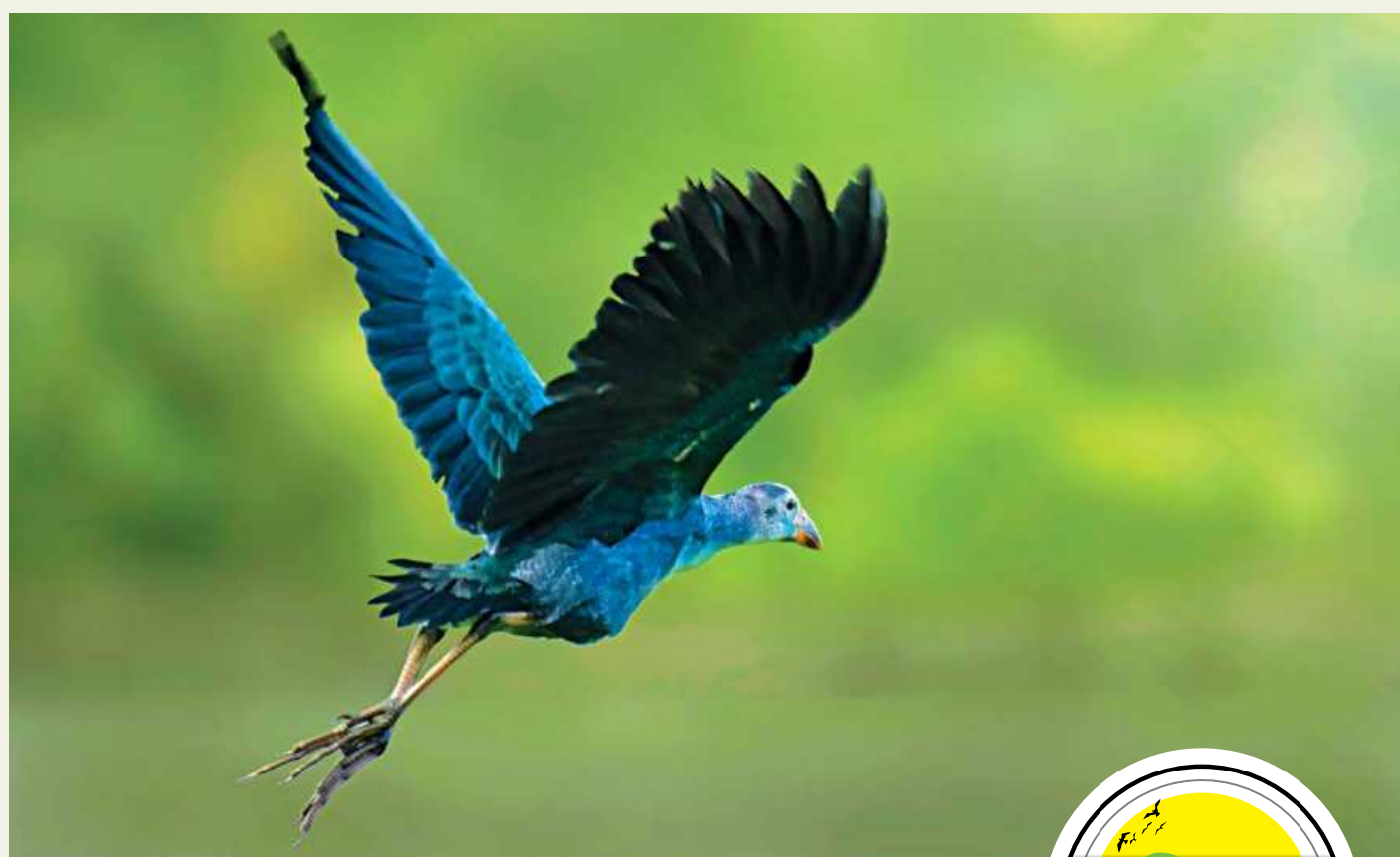
A purple Swamphen, popularly known as Kalim Pakhi, is seen flying over a water body in Keranipara of Rangpur sadar. Locals said a Swamphen flock goes there every year to breed but poachers have been catching the birds and selling them for Tk 500 each.