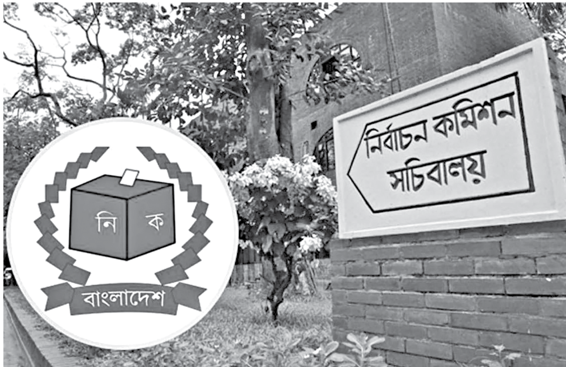
Is it the role of the EC just to ensure the logistics of election and be totally oblivious to its moral moorings?

Such delays, most likely because of mismanagement and lack of planning and collaboration, are unacceptable. The lab authorities must ensure that the total process is done smoothly, without causing any suffering to our workers. The government and the HSIA authorities also should look into the matter and intervene if/when needed. There can be no excuse for our migrant workers and other passengers not being given their Covid-19 test results on time, given how important the deadline is.