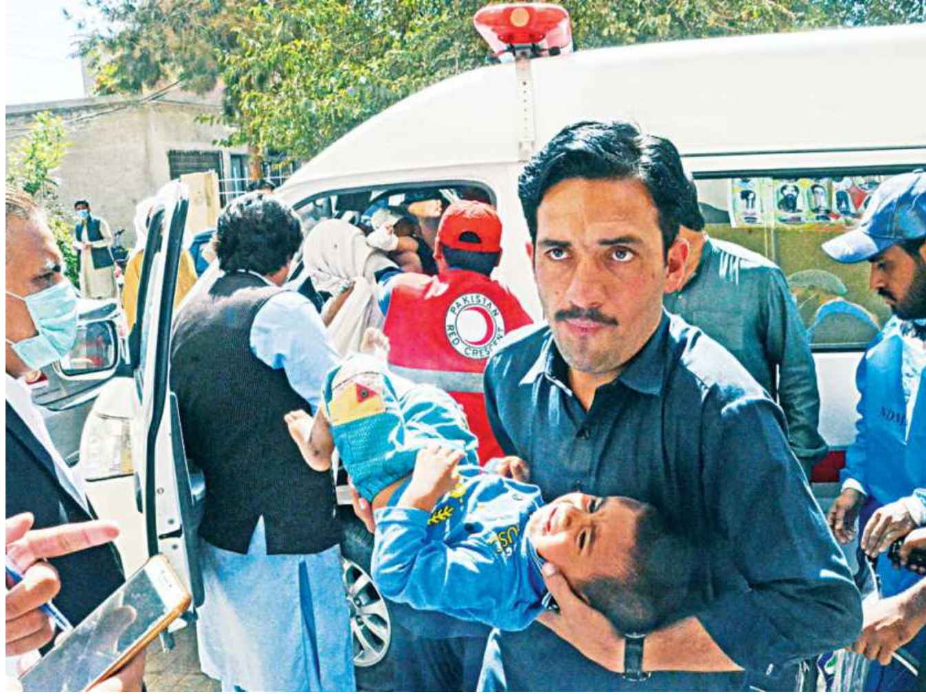
A man carries a boy who was injured, following an earthquake in Harnai, Balochistan, outside a hospital in Quetta, Pakistan yesterday. The tremor of magnitude 5.7 hit southern Pakistan in the early hours of yesterday, killing at least 20 people, most of them women and children, and injuring about 300, at a time when many victims were asleep, authorities said.

That could suggest that even if the virus develops resistance to JNJ-A07, it would no longer be transmissible via mosquitoes, effectively reaching a dead end in its host.