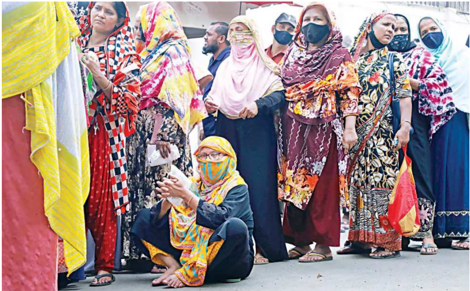
Exhausted, an elderly woman sits on the street while waiting to buy daily essentials at subsidised prices from a truck of Trading Corporation of Bangladesh (TCB) near the capital's Jatiya Press Club. The queue of buyers in front of the truck was long and the woman sat down after standing in the line for more than two and a half hours when this photo was taken around 12:30pm yesterday.