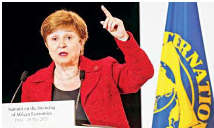
International Monetary Fund's Managing Director Kristalina Georgieva speaks during a joint news conference at the end of the Summit on the Financing of African Economies in Paris on May 18.