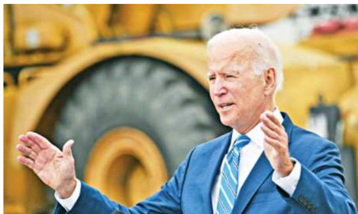
President Joe Biden says Congress must pass his spending plans to keep the US competitive in the world.

will give his agenda new life. He began his speech to the blue collar audience, gathering in a swing district won by Donald Trump during the 2020 presidential election, by saying there was "a lot of noise in Washington." "He then made his case for the $1.2 trillion infrastructure spending bill and a social support bill worth possibly around $2 trillion, saying that the government investment had underpinned private sector dynamism throughout US history and was now needed again. "We led the world in research and development... but then something happened. We slowed up," Biden said. "We risk losing our edge as a nation." He cited statistics that show US education and infrastructure have slipped far down the rankings in comparison to other advanced countries. "Our competitors aren't waiting," he said. "In recent years, China has