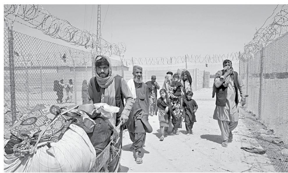
An Afghan family walks between fences to cross into Pakistan at the Friendship Gate crossing point, in the Pakistan-Afghanistan border town of Chaman, Pakistan, on September 6, 2021.

Third, the UN mandate should include regular monitoring and reporting to the Security Council on critical human rights issues. To receive the international recognition and aid for Afghanistan that they