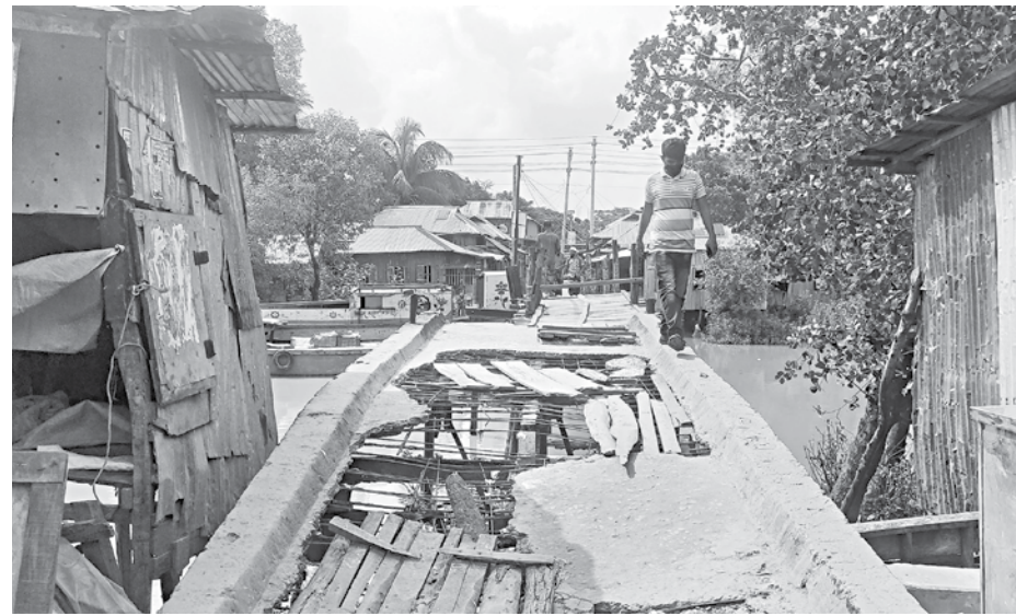
A man walks precariously on the edge of the bridge, on Gohinkhali canal in Patuakhali's Rangabali upazila, which was declared unfit by the LGED in 2012. However, the LGED is still awaiting approval for replacing this risky bridge with a new one.