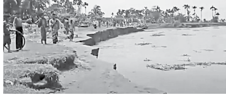
At least 20,000 people have been displaced in Bhola due to the erosion of the Meghna river. The photo was taken from Char Mohammad Ali point in Rajapur union of Sadar upazila.

The erosion could not be averted, despite several steps undertaken by the Water Development Board of Bhola.