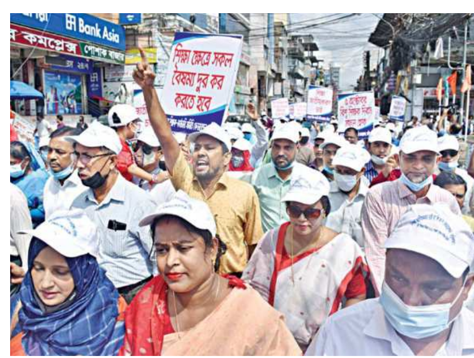
With a demand to nationalise education, "Bangladesh Shikkhok Karmachari Samiti Federation" brought out a procession on Barishal city's Sadar Road yesterday.

"The government has plans to nationalise education SEE PAGE 4 COL 3