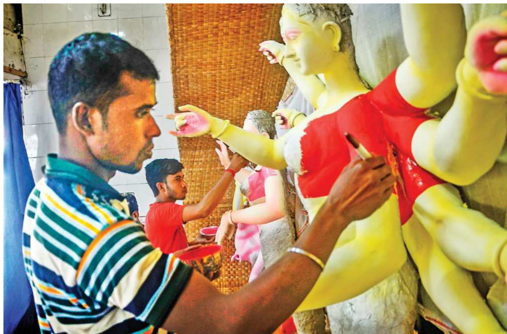
An artist puts the finishing touches to an idol of Hindu Goddess Durga at Dhormoshoba Temple at Khulna city's Picture Palace intersection yesterday. The largest religious festival of the Hindus will be celebrated from next week at 1,003 temples in Khulna district, including 132 in the city.

The study found that the number of person-days soared from 40 billion a year in 1983 to 119 billion in 2016, representing a threefold increase. In 2016, 1.7 billion people were subjected to extreme heat on multiple days.