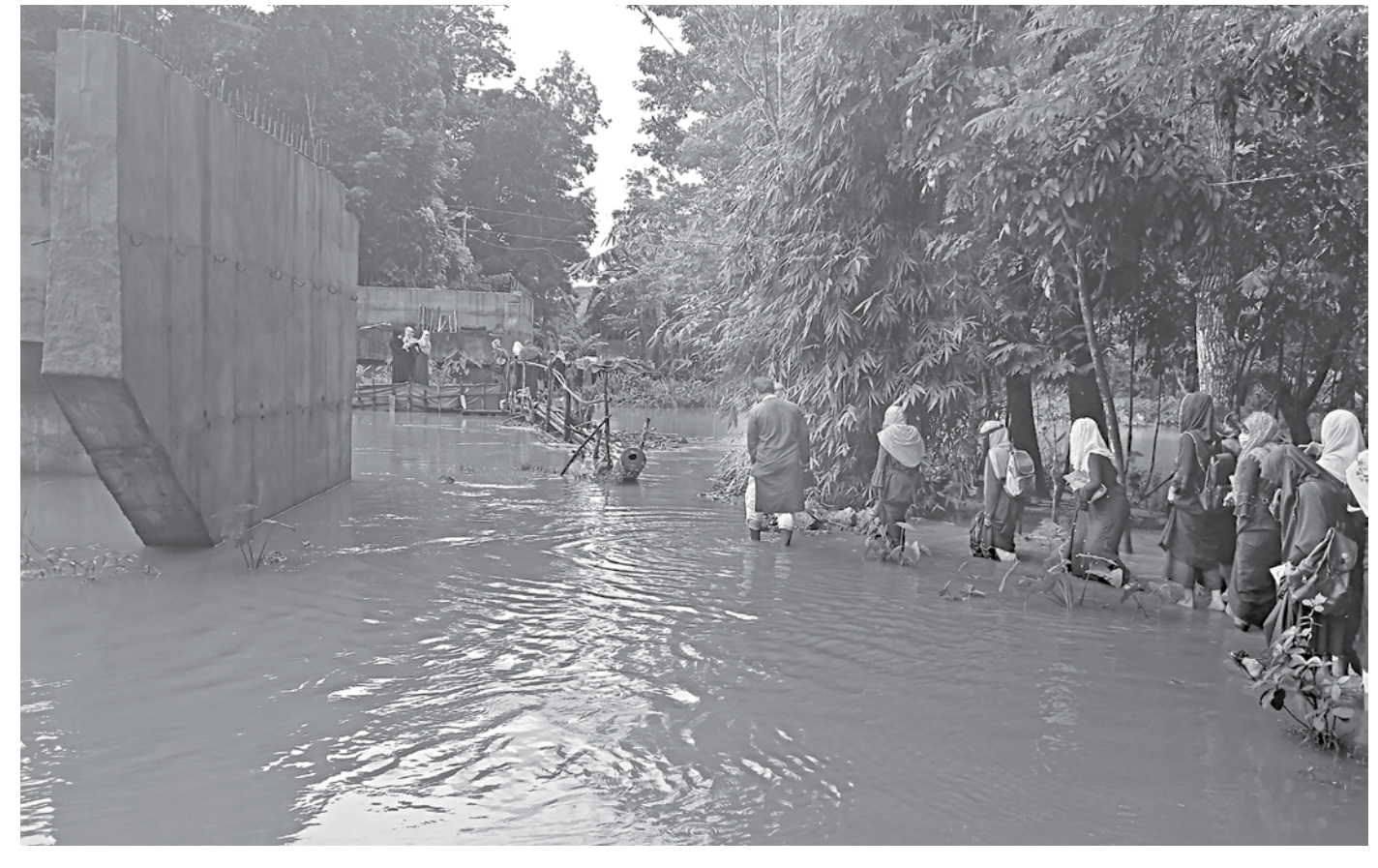
Students and locals wade through knee-deep tidal water on way to a makeshift walk bridge built on the Muradia, a turbulent river running between Muradia and Srirampur unions in Dumki upazila. The photo was taken recently.

Muradia Mohila Fazil Madrasa, said out of the 325 students in his madrasa, 150 students live on the west side of the river.