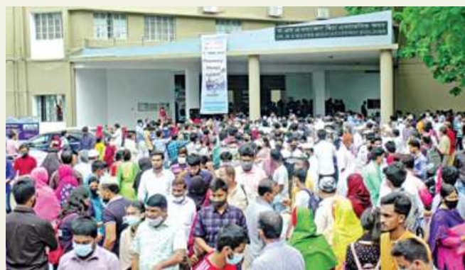
Many admission seekers and their guardians have taken up abode at the city's Kazla Gate Masjid, after finding no other suitable accommodation. Meanwhile, the RU premises were buzzing with people from across the country yesterday, inset.