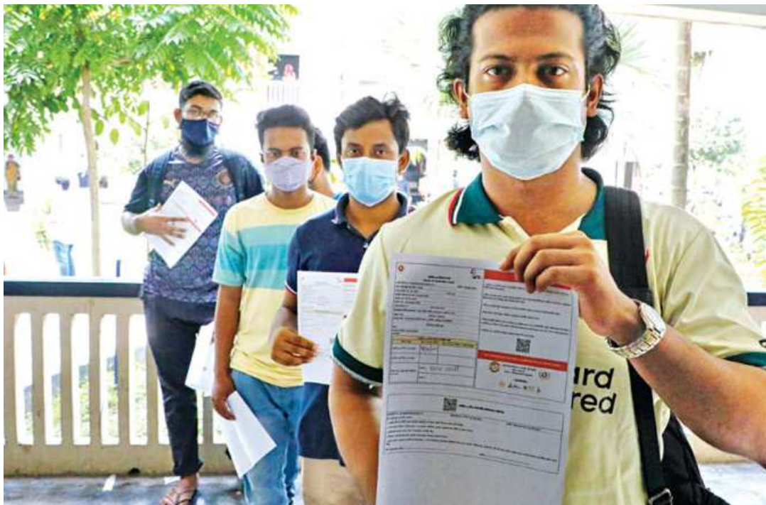
The special vaccination drive started at the medical centre of DU yesterday. The centre has facilities to vaccinate around 5,500 students, along with some teachers and staffers.