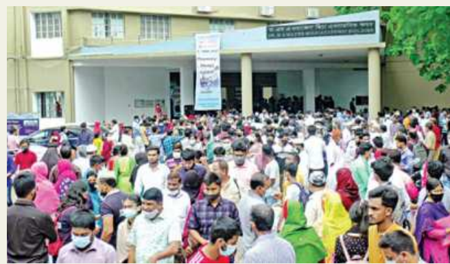
Many admission seekers and their guardians have taken up abode at the city's Kazla Gate Masjid, after finding no other suitable accommodation. Meanwhile, the RU premises were buzzing with people from across the country yesterday.