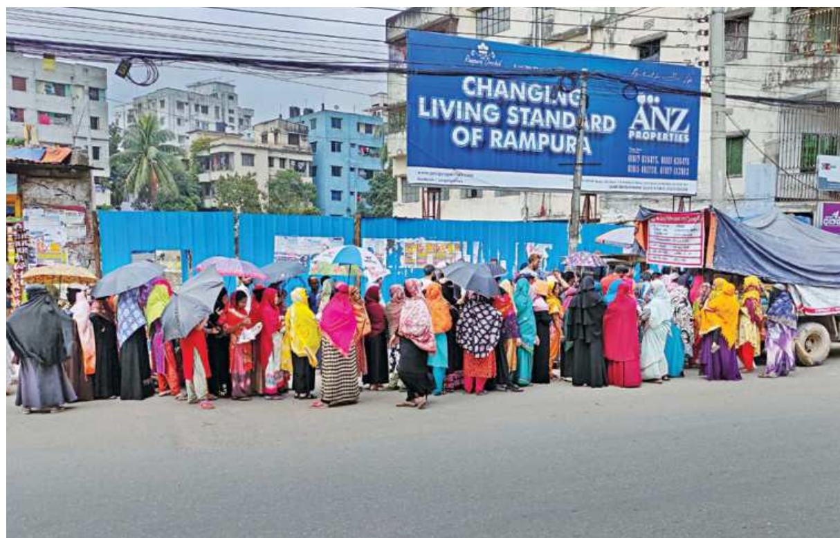
With the price of everyday household items going out of reach, people have started turning up in numbers to get their groceries at subsidised rates from Trading Corporation Bangladesh (TCB) trucks. Under yesterday's overcast skies, people held up umbrellas and queued up in long lines at the capital's South Rampura's designated TCB truck spot.