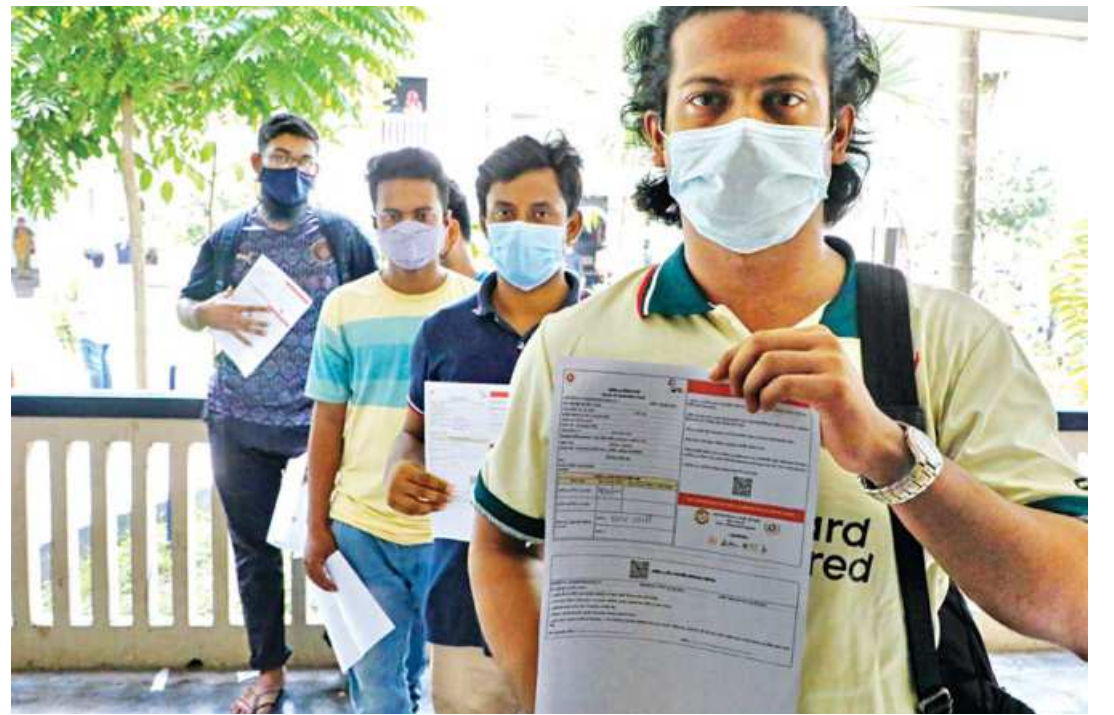
The special vaccination drive started at the medical centre of DU yesterday. The centre has facilities to vaccinate around 5,500 students, along with some teachers and staffers.