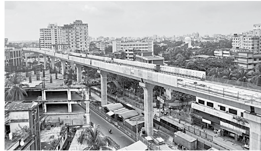
Megaprojects are crucial for long-term economic growth of a country, but time and cost overruns turn them into a waste of taxpayers' money.