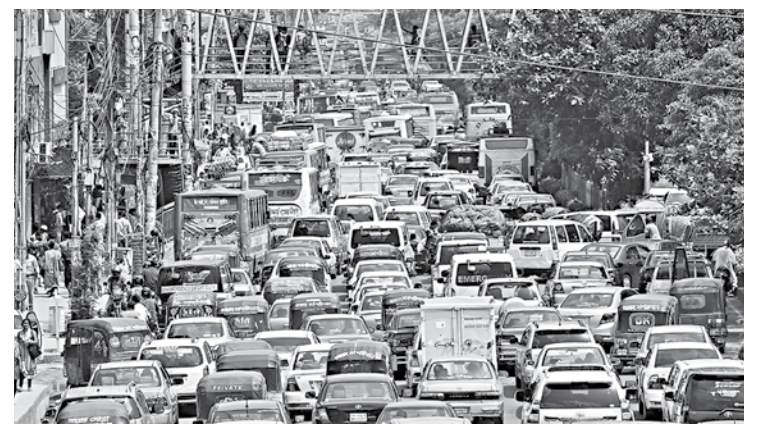
With a few simple, efficient steps, this picture of Dhaka, which is now painfully common, could become history.

Very recently, for 18 months, I did not use motorised transport. I took lots of walks and went jogging near my home. I took a few short rickshaw rides and one or two bicycle rides. Mostly I stayed hyper-local, in contrast to my previous hyper-mobile lifestyle. The more time I spent in my Dhaka neighbourhood, the more I appreciated it. Most people are on foot. People sell things on the sides of the road, from rickshaw vans and bicycles and directly on the street. In the evenings, people stroll around, looking at the goods and chatting with the vendors.