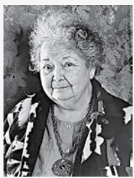
PAULA GUNN ALLEN (1939 - 2008) American poet

Truth, inwardly accepted, humbling truth, makes one vulnerable. You can't be right, self-righteous, and truthful at the same time.