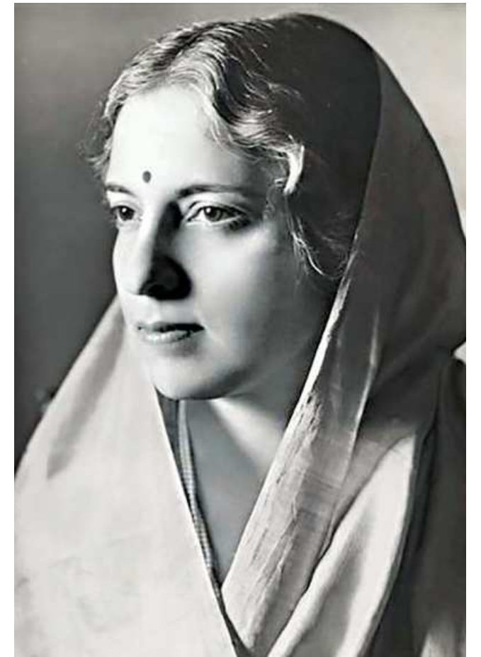
Vijaya Lakshmi Pandit

Finally Vijaya and Syud decided to get married as secretly as possible. In an autumn forenoon in 1919 Vijaya came over to Syud's bungalow, and the marriage took place there.