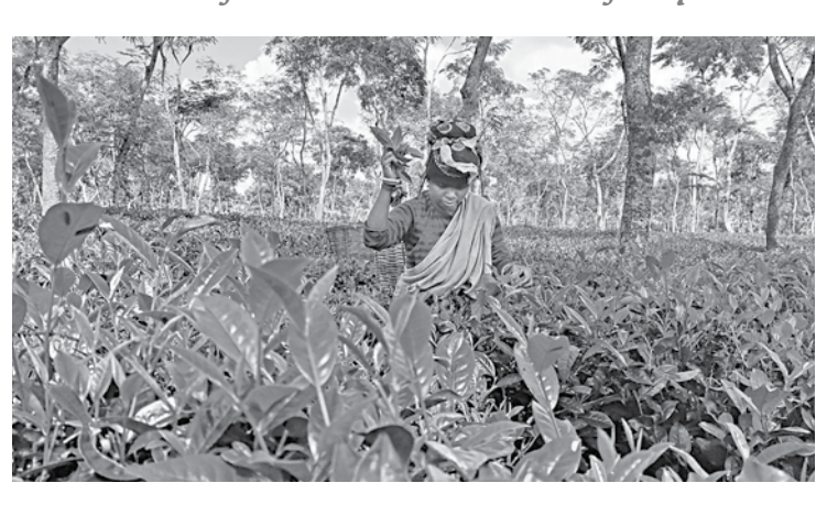
A worker collects tea leaves at a garden in Habiganj.