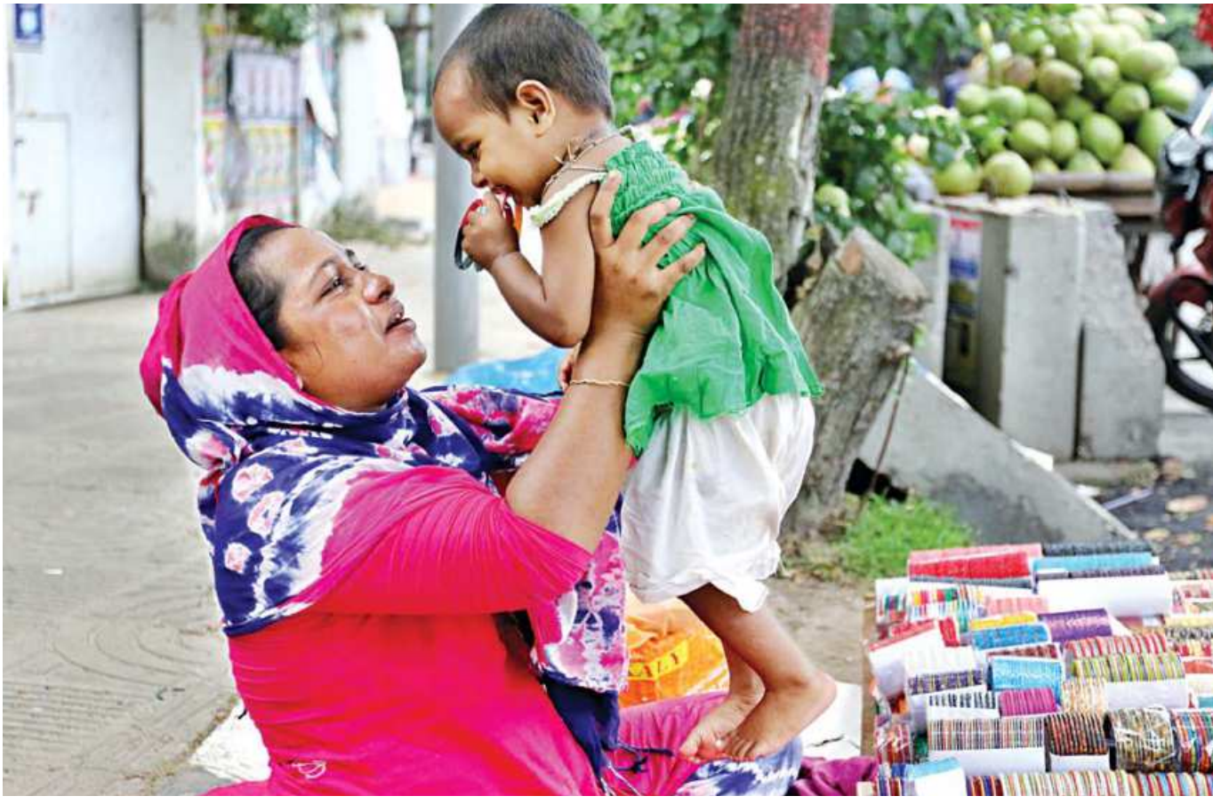
Clad in red and green, a mother-daughter duo is busy at play during the slow hours of their bangles business at Dhaka University area. Juggling motherhood and work this way can be a difficult undertaking, but mothers like her still find a way around it with a smile on their faces. This photo was taken yesterday.