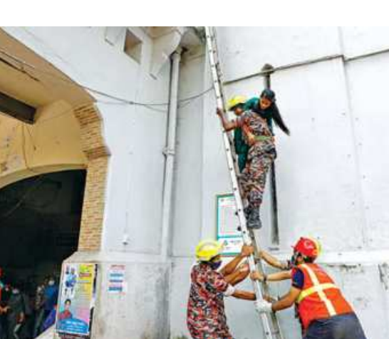
Ahead of the International Day for Disaster Reduction on October 13, the Ministry of Disaster Management and Relief hosted a fire drill at Dhaka Medical College Hospital premises yesterday, supported by the Fire Service and Civil Defense Department.