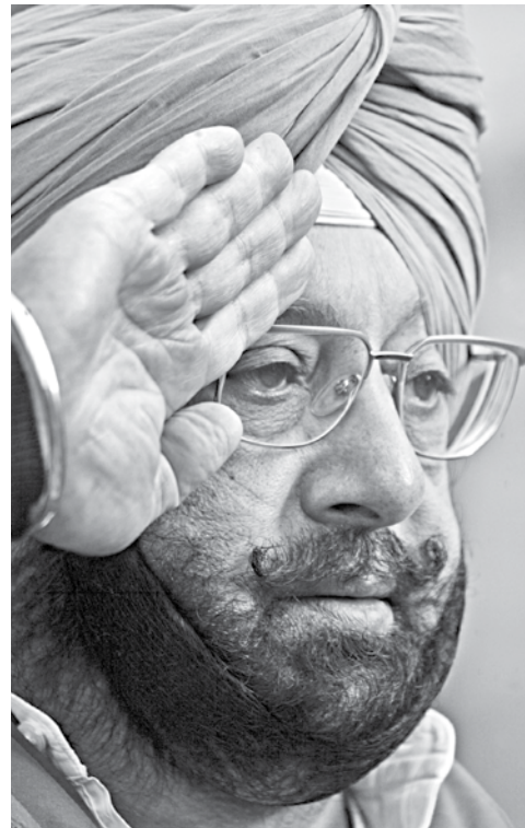
Chief Minister of the northern Indian state of Punjab Amrinder Singh salutes in front a war memorial during a ceremony to mark Infantry Day in a garrison in Srinagar, October 27, 2005.

Sibal could not perhaps be more scathing of the Gandhi family. Without naming them, he told the media on September 30 that there was no knowing who were taking decisions in the party. Sibal was backed by many of the group of 23 senior leaders of the Congress who have been demanding organisational elections and a course correction in the party. Within hours of Sibal's criticism of the party high command, he had to face the music as