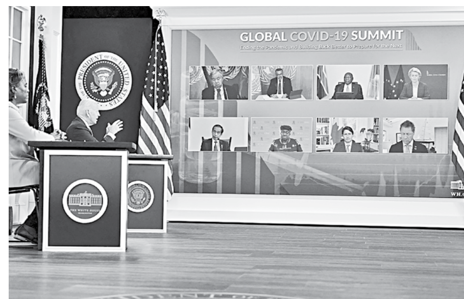
US President Joe Biden speaks as US Ambassador to the UN Linda Thomas-Greenfield listens during a virtual Covid Summit of the United Nations General Assembly.

As a charity has noted, “Instead of partnering... to make sure that we have