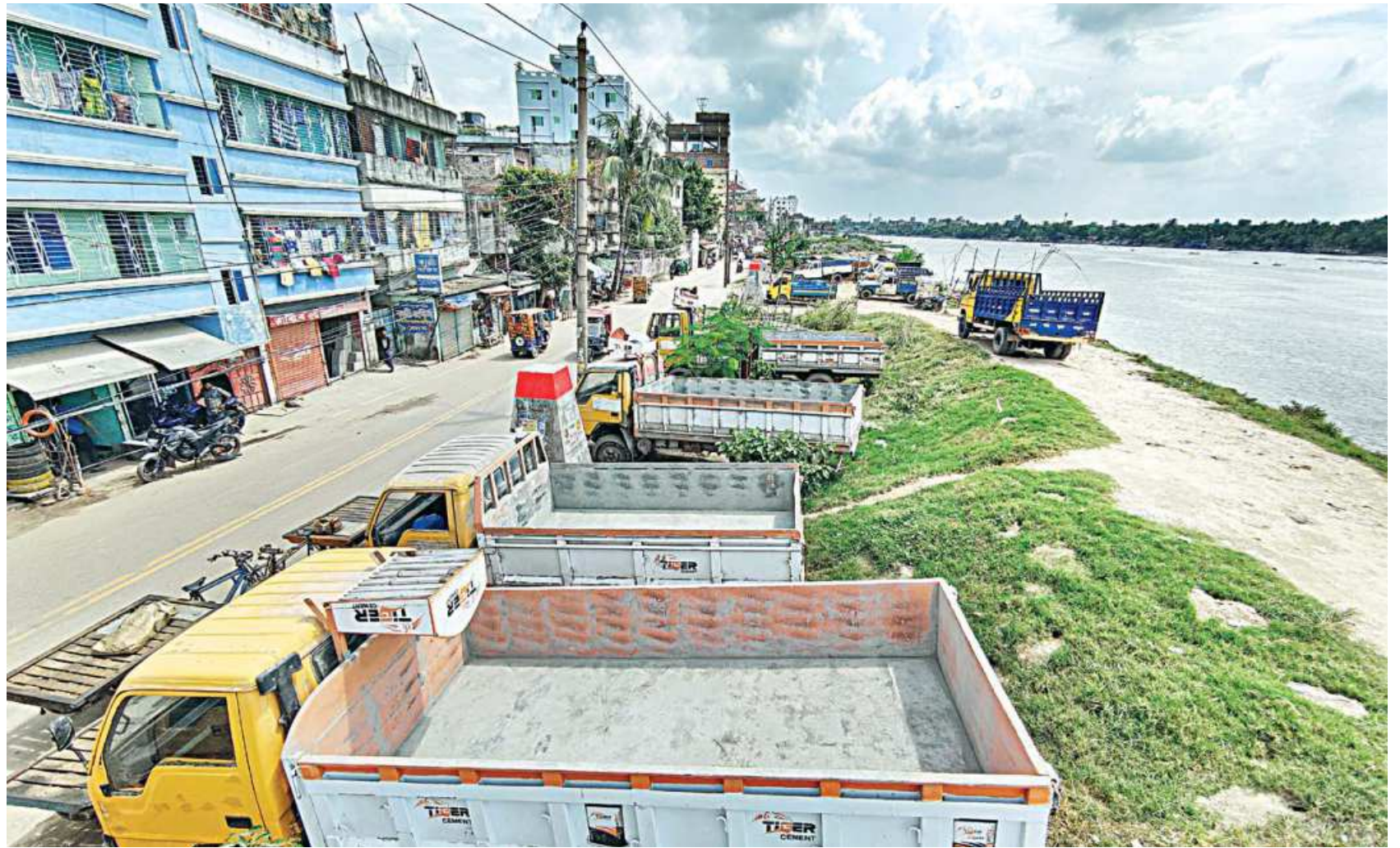
Trucks parked on the bank of the Buriganga at Kholamora ghat in the capital's Kamrangirchar. Influential locals encroached upon the river to make this truck stand. The BIWTA removed other structures that encroached upon the river, but the truck stand remains. The photo was taken recently.