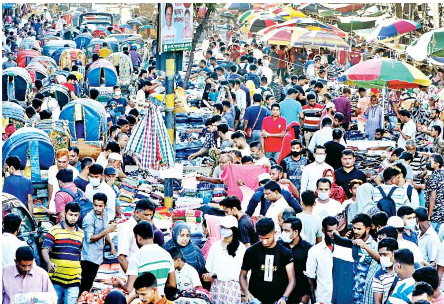
THE OLD NORMAL?... Hundreds of people shopping at a street market in the capital's Gulistan yesterday evening. Other than one or two people wearing masks, the picture is similar to those of pre-pandemic times. Covid-19 transmission has been steadily declining across the country and people have been ignoring the health safety guidelines.