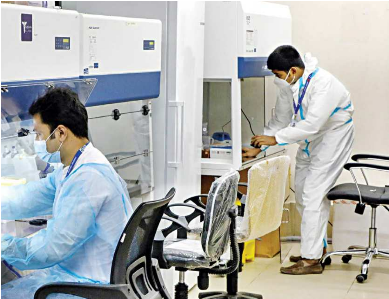
Health workers testing samples at the RT-PCR lab at Hazrat Shahjalal International Airport yesterday. The lab was set up after the UAE made it mandatory for arriving passengers to have been tested for Covid-19 six hours before boarding the plane. The UAE approved operations of the RT-PCR laboratories at the Dhaka airport.