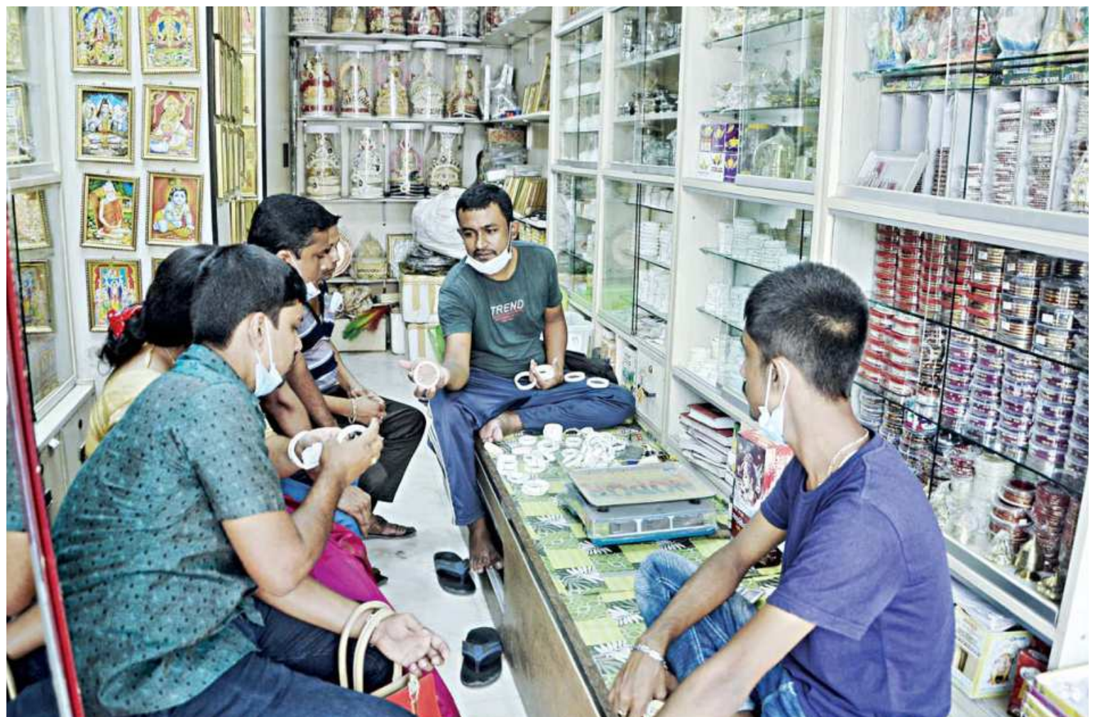
People from the Hindu community are out to shop ahead of the Durga Puja, which is only two weeks away, allowing sales to rebound after a lull this time last year owing to the coronavirus pandemic. The photo was taken from Dharma Sabha Temple area in Khulna recently.