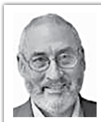
JOSEPH E STIGLITZ

M OVES are afoot to replace or at least greatly weaken Kristalina Georgieva, managing director of the International Monetary Fund (IMF) since 2019. This is the same Georgieva whose excellent response to the Covid-19