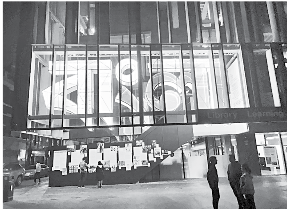
Despite such a large presence of Bangladeshis in London—and in the UK—their pandemic vulnerability has not received the attention it deserves. The photo was taken in East London, where a giant sculpture named BANGLA has been installed to commemorate 50 years of Bangladesh's independence.

Much like London, specific targeting of the community through appropriate language resources was inadequate in New York. Bangla is the fourth most spoken language among